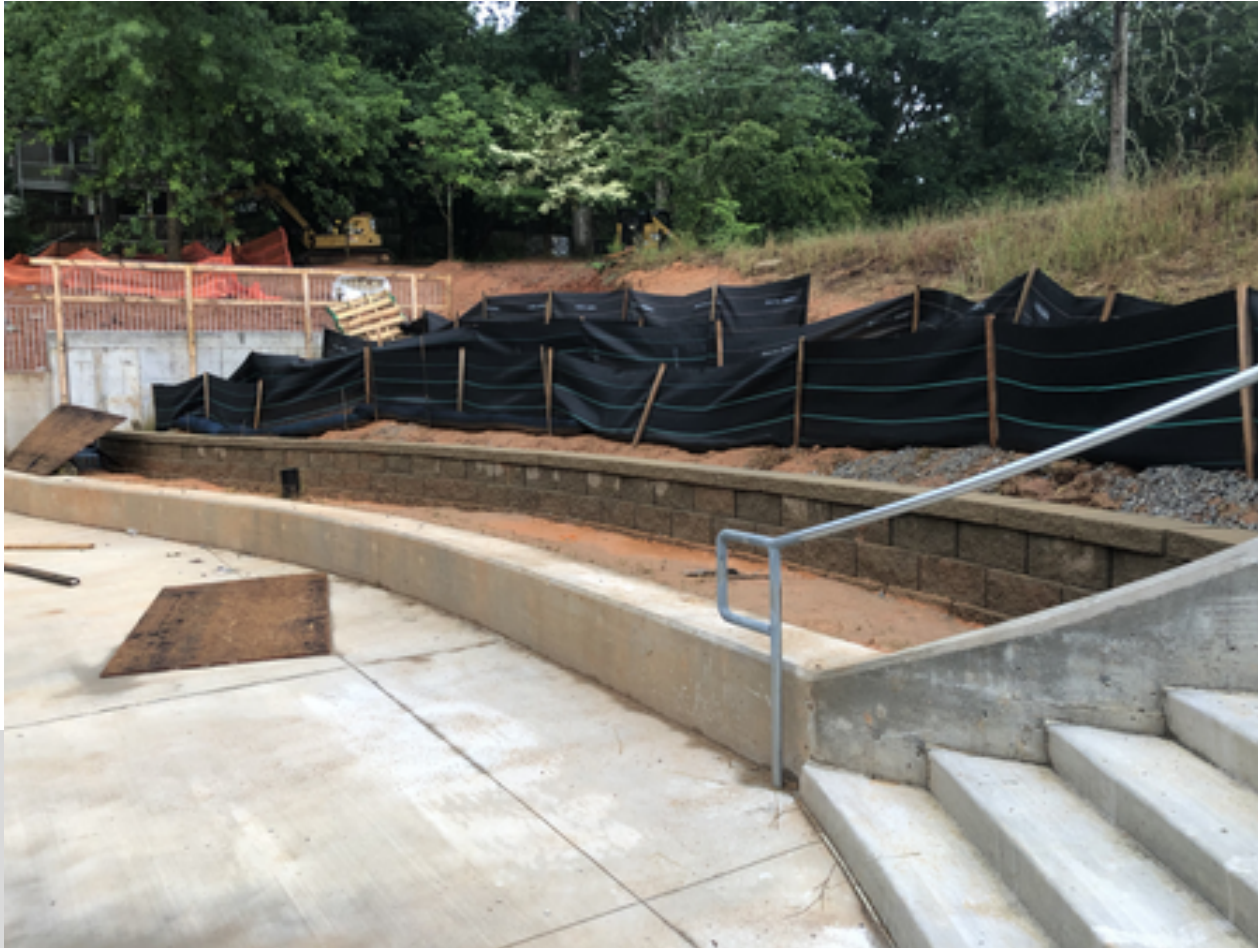
Seat wall installation