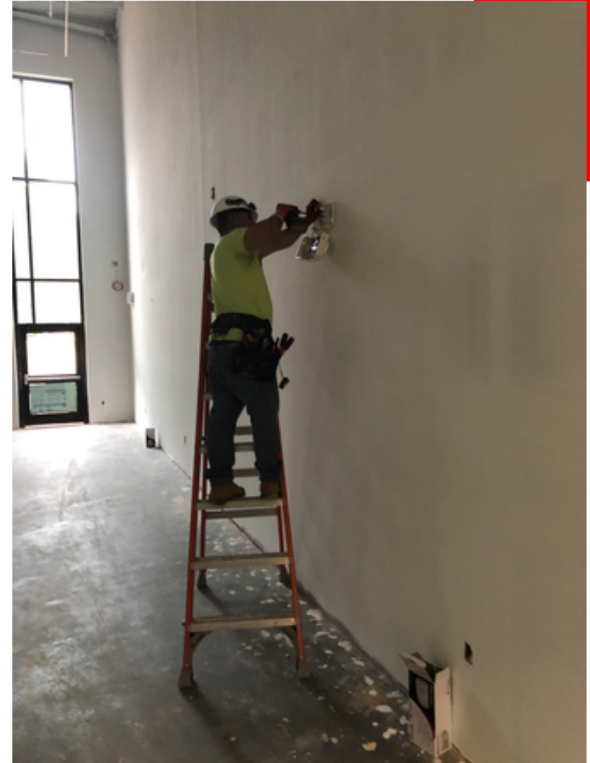
Fire alarm system install