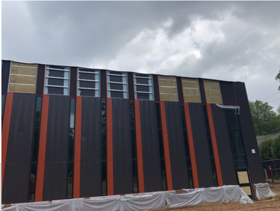
Metal wall panel installation