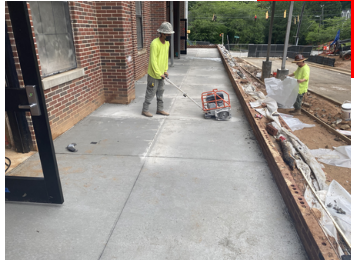
Curtain wall at bridge installed